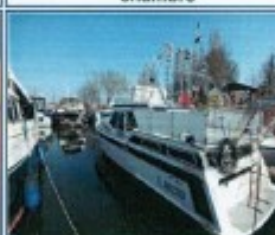
Smelne Vue arr babord